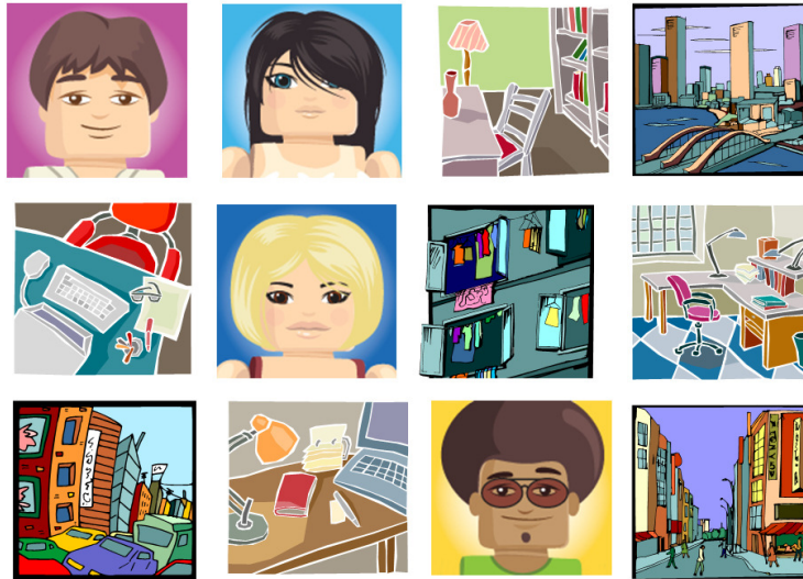
Fun virtual team building game ... www.virtualteamintelligence.com

In your typical work environment people see each other “face to face” almost every day. People chat about their weekends, get to know each others quirky personality traits and forge bonds as they participate in fun team building activities.